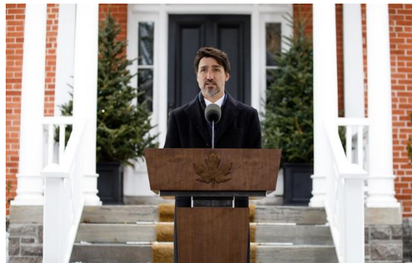
Prime Minister Justin Trudeau holds a press conference outside his home in the early months of the pandemic.

In addition to our advocacy work, we contributed a chapter on Tax Fairness for the CCPA's special Alternative Federal Budget Recovery Plan . In it, we outline how progressive taxes can help reduce the deficit and rising inequality. Some of our proposals include taxing foreign digital giants and introducing an excess profits tax on large companies that have profited during the pandemic.